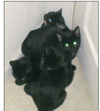
Frightened kittens huddle together