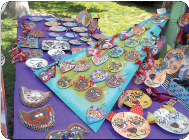
One of the vendors, the Peculiar Palette