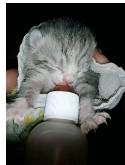
Feeding time before...